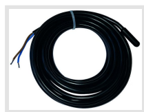
TF06 Temperature sensor